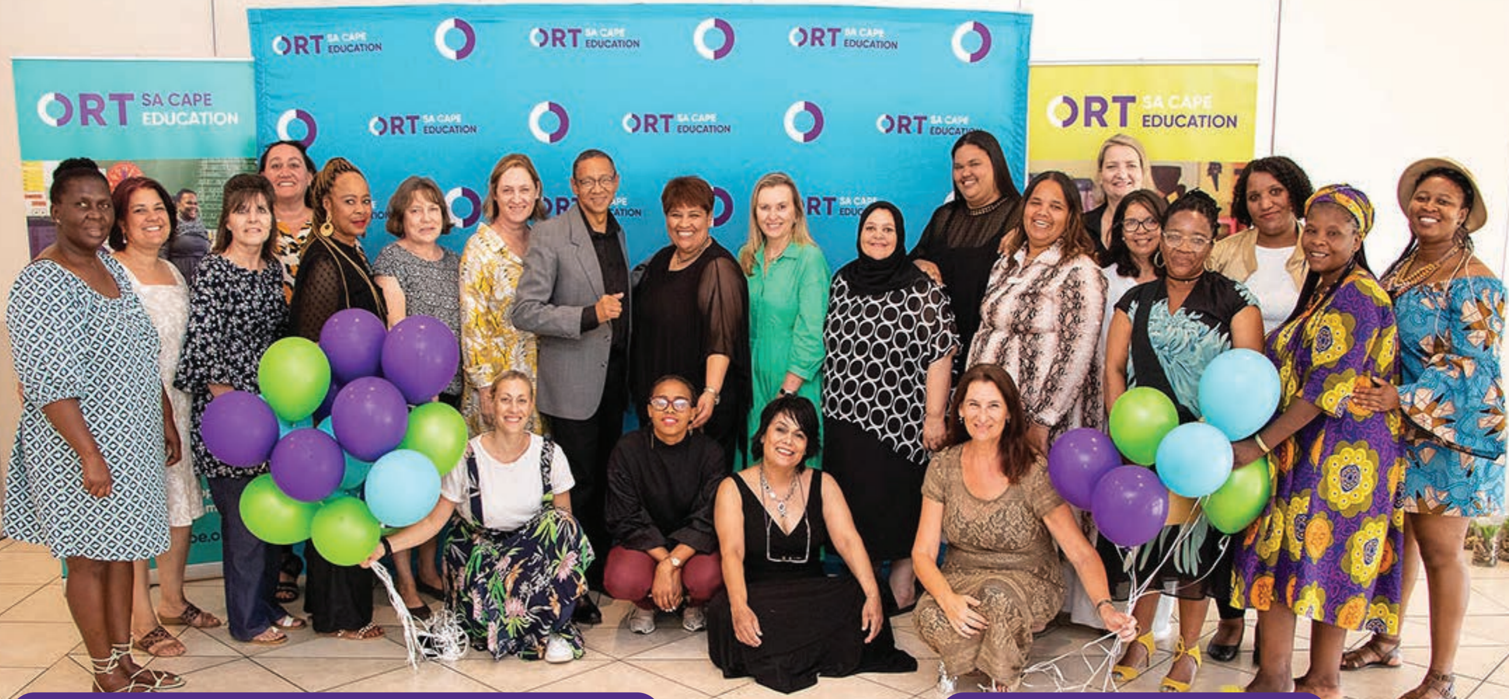
Changing lives through education